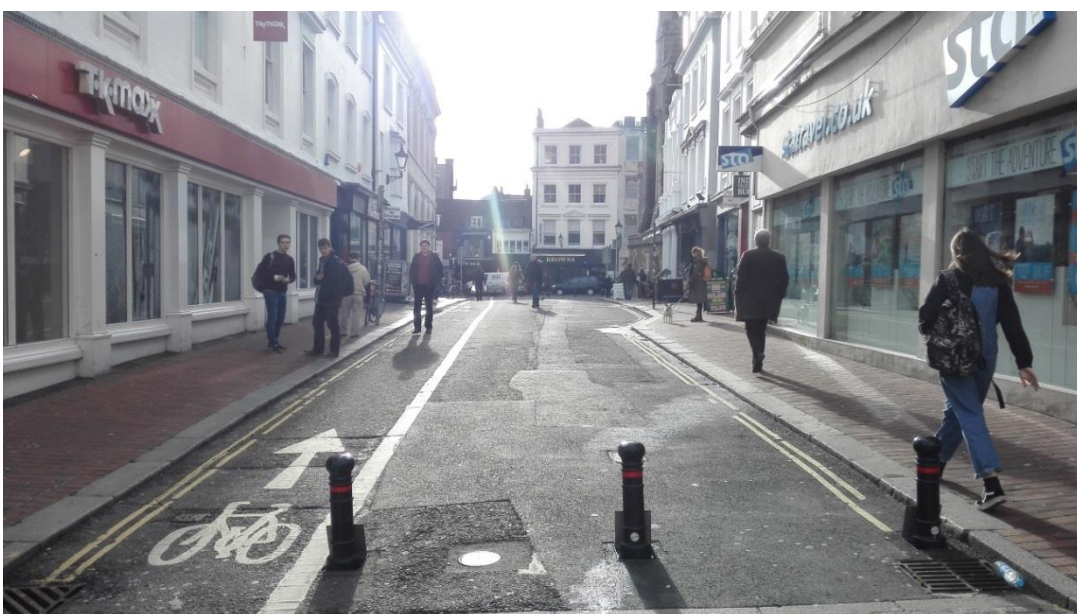
The north end of the Ship Street site, looking towards the Lanes.