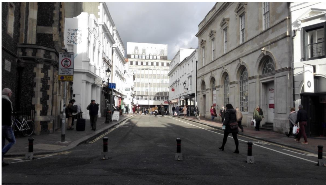
The south end of the Ship Street site, looking towards North Street.