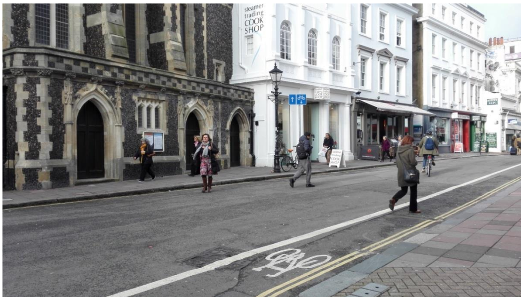
The Ship Street promotional site.